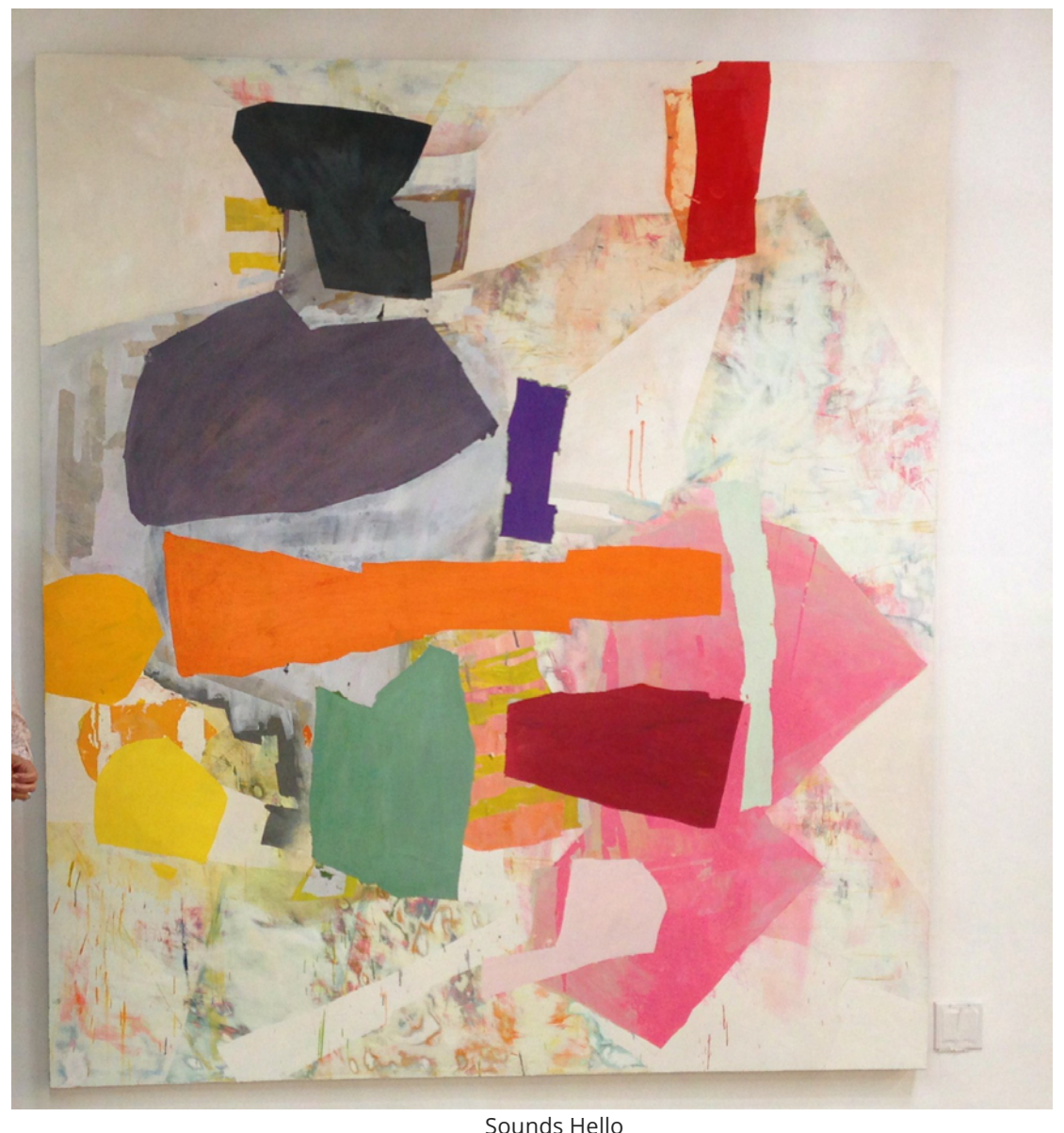
Sounds Hello oil on panel, 2014-15, 90 x 80in