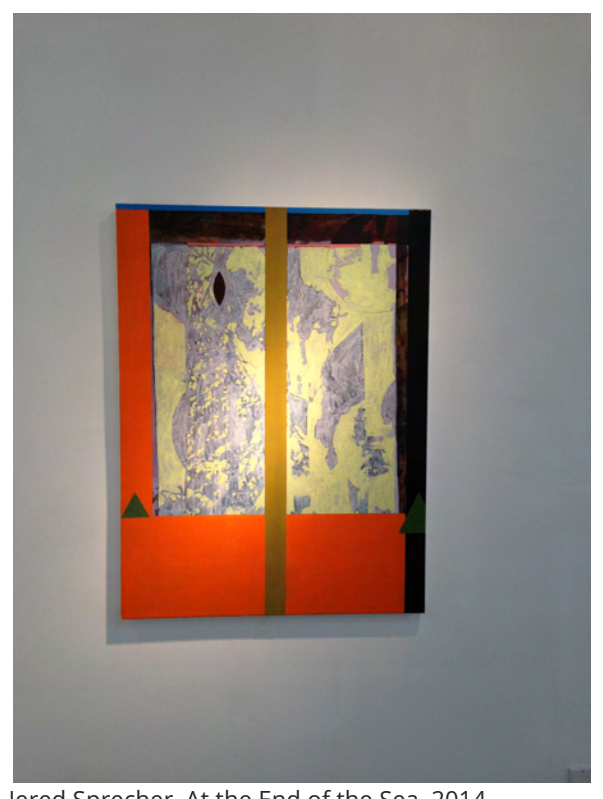
Jered Sprecher, At the End of the Sea, 2014 Oil on Canvas, 40 x 30 in