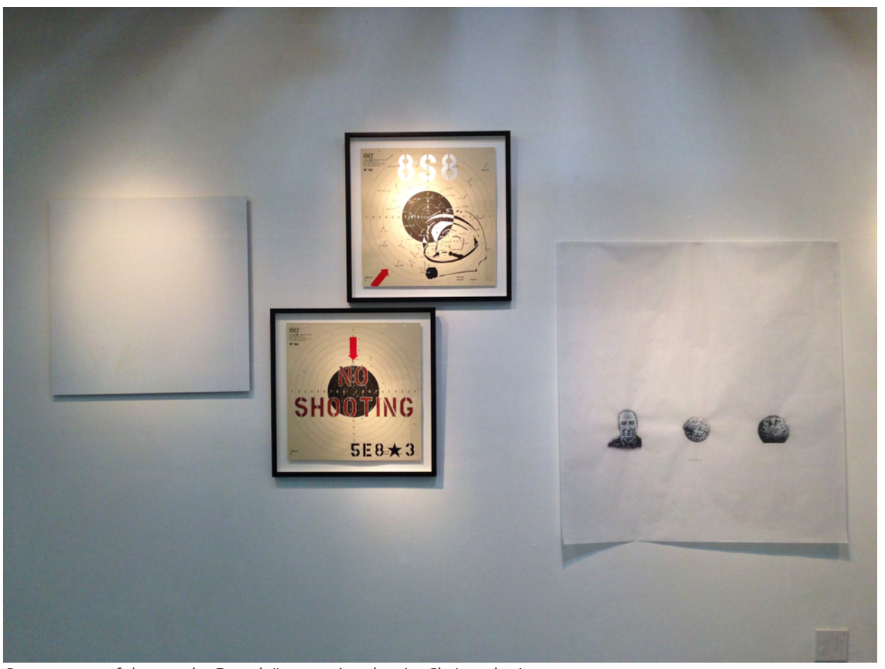
Center: powerful target by French/International artist Christophe Leroux

In current exhibition each painting shows an intentional gesture, accurate but free. If the intention was to demonstrate that we do have great Californian painters to create our own Salon des Réalités Nouvelles, yes and they were outstanding. We can't wait to see the next series. BCh