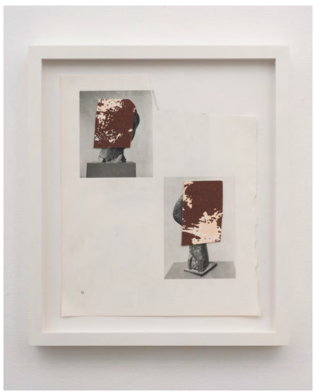
Brion Nuda Rosch, 2 Busts, 2012 Acrylic on paper on found book page, 11.5 x 9 in